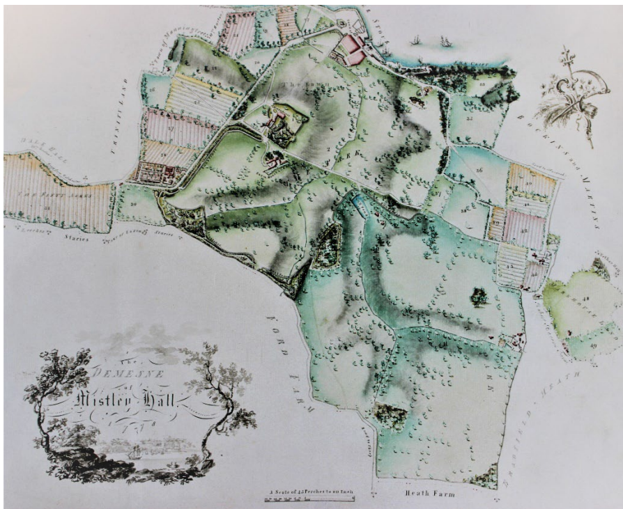
Figure 1 Survey of Mistley Hall 1778

To the south of the conservation area, around Mistley Park, there was some confusion at public consultation about why the boundary falls where it does, particularly as it is hard to follow on the ground within the woodland plantation. Place Services have reviewed the boundary on the ground and through historic map analysis to readdress the conservation area boundary.